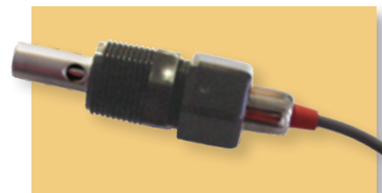
Assembled Conductivity Sensor

The CS51 is ideal for general purpose use up to 20,000 µS/ppm.